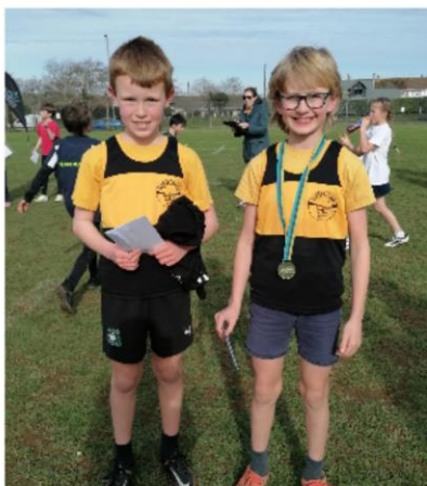
Semi Finals at Helston Community College: