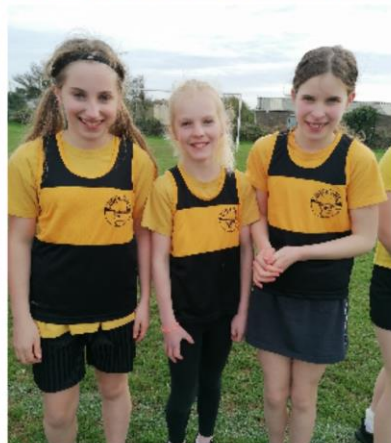
Finals at Newquay Sports Centre: