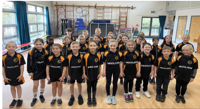
Year Four children sporting our new PE tops!